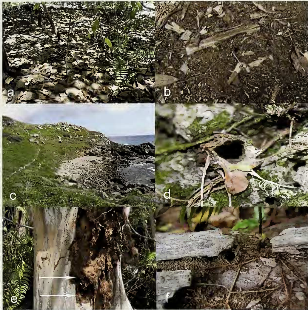
Figure 1a–f.—Substrate types in which burrows of Nesiergus insulanus are found on Frégate Island, Seychelles. a. Leaf litter; b. Bare soil; c. Grass; d. Rock; e. Tree trunk with arrows indicating position of burrows approximately 1.5 and 1.7 m above ground level; f. Recumbent rotting log.

densities per square meter combined from sample sites in each habitat type were as follows: Exotic scrub 8.4 at 0.042/m 2 , native woodland 36 at 0.18/m 2 , coconut-dominated woodland 11.4 at 0.057/m 2 , Ficus benghalensis 36.5 at 0.1825/m 2 , mixed exotic woodland 6.5 at 0.01/m 2 , grassland 3.5 at 0.0175/m 2 , hotel area native planted 15.4 at 0.0775/m 2 , coconut woodland planted with natives 1.7 at 0.0085/m 2 and replanted native woodland 21 at 0.105/m 2 . Microhabitat variables varied between sample sites (Table 1) with the mean ambient temperature found to be 2.13°C higher than the temperature within the burrows across habitat types. In contrast, the humidity within the burrows was found to be an average of 9.93% higher than the ambient humidity. Open grassland was the only habitat in which at least some burrows were found to be fully exposed to the sun. The mean ambient temperature for grassland was 2.5° C warmer than the mean across all habitat types. The mean seasonal change in temperature is in a very narrow band and this is reflected in the mean temperature across habitat types.